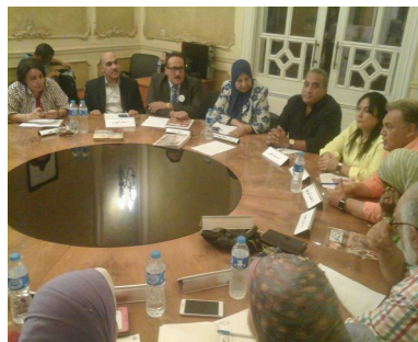
The Egyptian Library Association