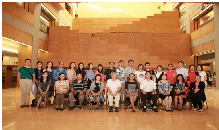
Attendees at the CALA/BALIS two-day training seminar.