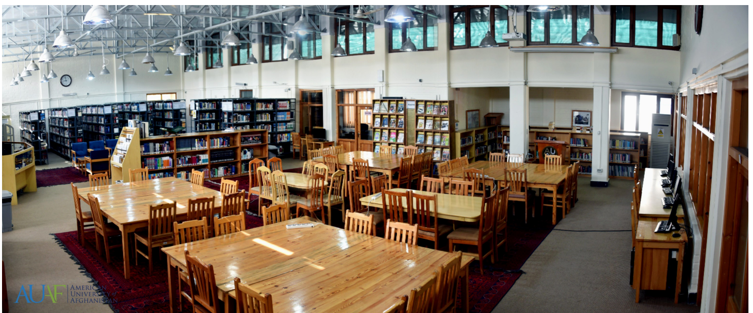
View of the main reading room in the Main Library, AUAF.

را به دست آورده است. علاوه بر این، بخش خدمات توزیع کتب درسی برای محصلین نیز راه اندازی شد و در حدود ۱۵۱۹۴ جلد کتاب درسی در انبار این کتابخانه موجود میباشد که بطور اوسط ۲۴۵۱ کتاب در هر سمستر توزیع می شود. برای پیشبرد و مدیریت ثبت معلومات و ریکورد دانشجویان، کتابخانه از سیستم کتابداری آنلاین بنام "کوها" استفاده و خدمات به دانشجویان ارائه میکند. در حال حاضر این کتابخانه دارای نه کارمند میباشد و از هشت