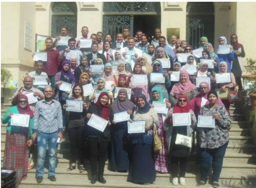
Participants in the Greater Cairo librarian training program proudly show off their certificates of participation.