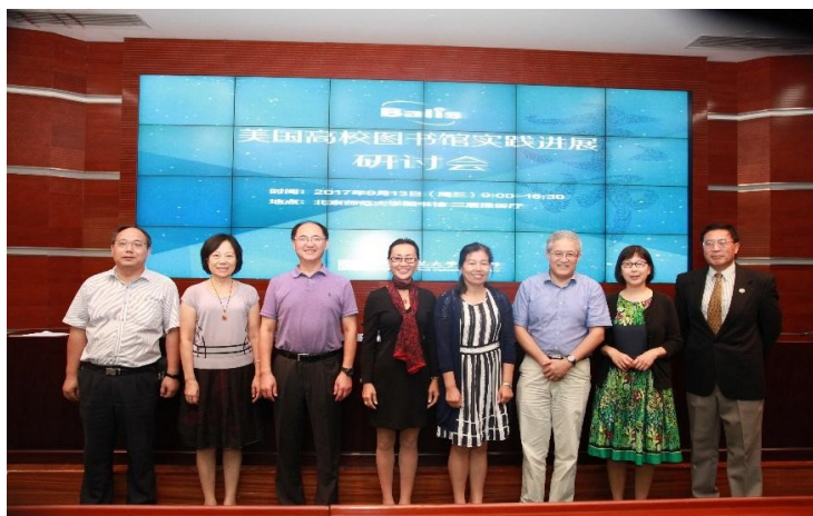
Members of CALA visiting Beijing pose with their hosts.

Have you participated in a visit or exchange with international librarians? Consider submitting a report for International Leads.