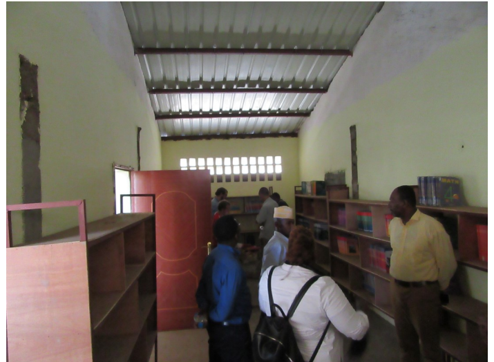
Peace Corps Volunteers visiting a school library in Comoros.

Have you been a Peace Corps Volunteer and worked with libraries in your host community? Consider sharing your story with International Leads readers.