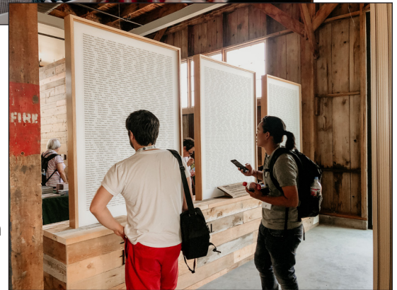
Visitor center dedication on July 7th.

left together. We would love to hear more about their lives, their relationship, and to capture any photographs that might exist in order to share this story more broadly. Please send any information to mia@minidoka.org , or call (208) 863-0076.