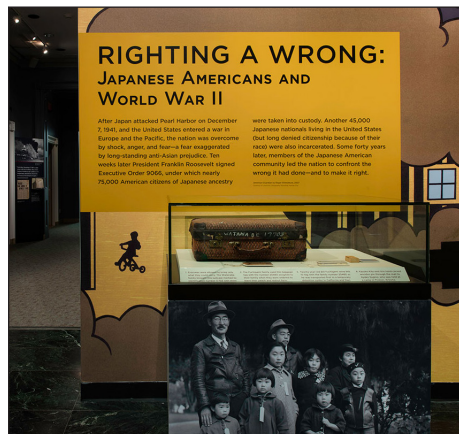
Entrance to Righting a Wrong exhibit at the National Museum of American History.

• JANUARY 25, 2020 Opening of Righting a Wrong traveling exhibition, Idaho State Museum, Boise, ID, 10:00am - 5:00pm.