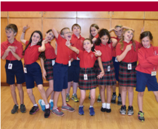
Students from St. Matthew Catholic School did a great job of fundraising during Hands Around Our School.