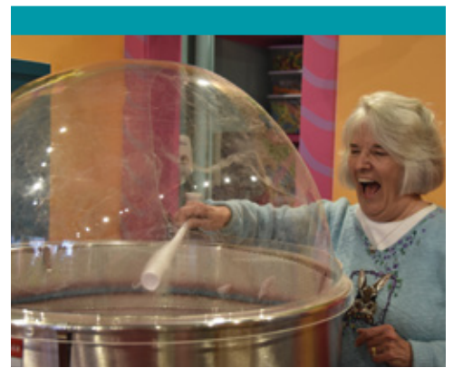
Spinning at Cotton Candy Factory is a favorite for children of all ages!