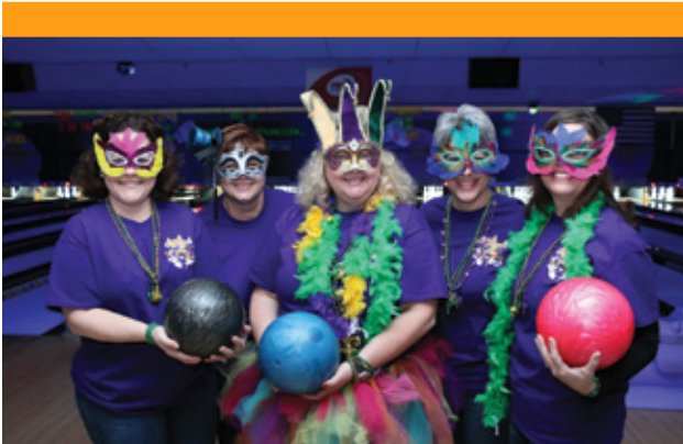
This CaroMont team really got into the spirit of Mardi Gras!

Over 1,300 people came out to celebrate and participate in our 25th Annual Angel Bowl on Saturday, March 4th at Liberty Lanes, Gastonia. We are thrilled to announce that we have raised more funds than ever – surpassing $200,000.00! Many thanks to all the wonderful bowlers, sponsors and volunteers who made this year such a success!