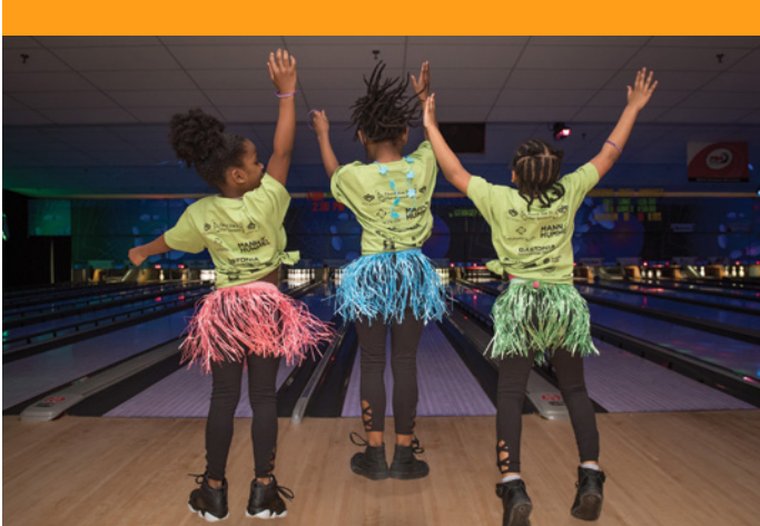
Oh the joy of making a strike!