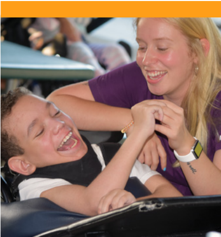
Nothing better than summer fun at Push Place.