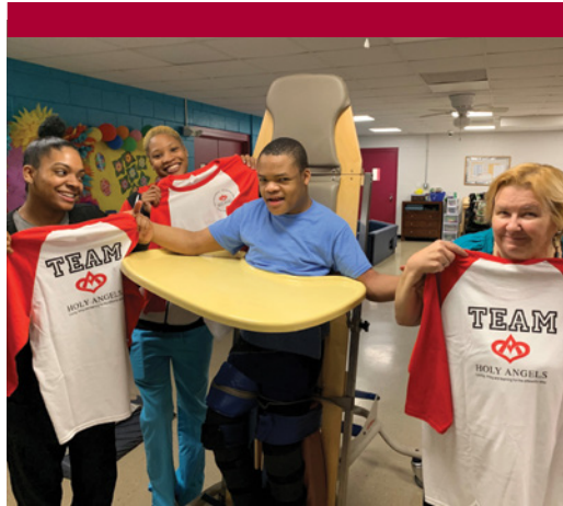
Celebrating CARF success with Team Holy Angels.