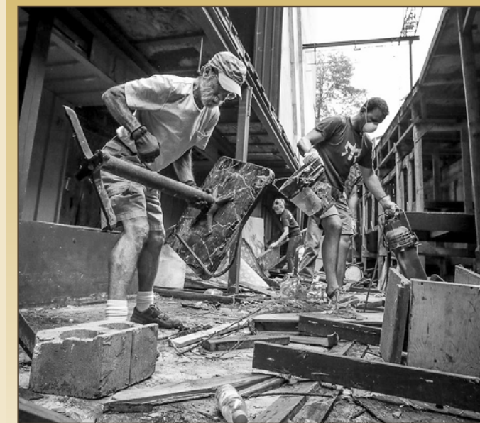
Volunteers clean up stage.

The Starlight Bowl, for many years home to the San Diego Civic Light Opera, is the venue where generations were entertained under the stars in