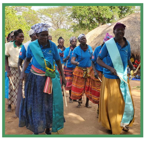
Members of one of our Dance+Therapy groups presents a dance and song they created to express their experiences as survivors of war/exploitation... and as women with disabilities or caregivers to people with disabilities.