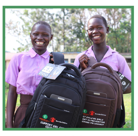
Two girls who are evidently thrilled to receive their own new book bags for their return to school. THRIVE supports young parents to return to school with school fees, supplies, and group & individual counseling.