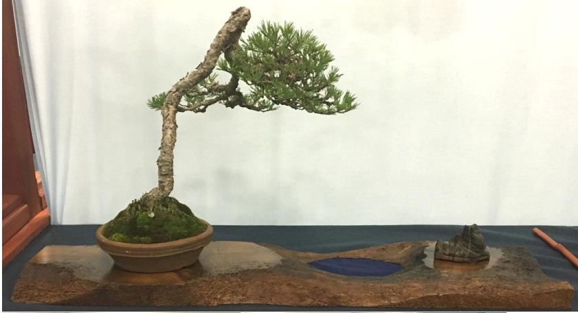
Scots Pine