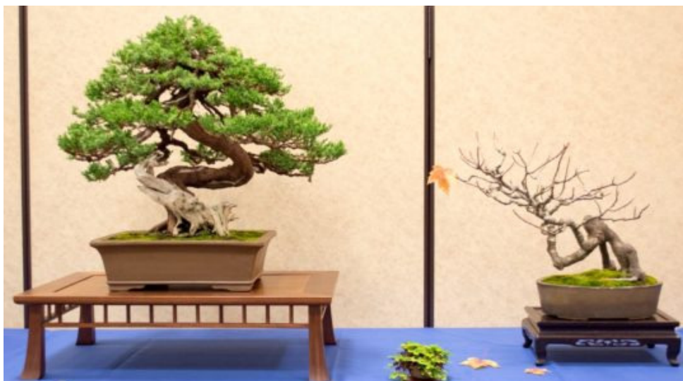
Procumbens juniper and maple

The 2016 Pacific Northwest Bonsai Clubs Association exhibit in Olympia