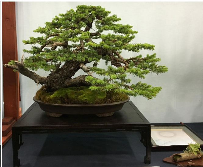
Colorado Blue Spruce by Todd Schlafer