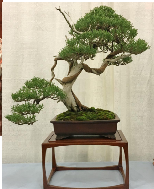
Rocky Mountain Juniper