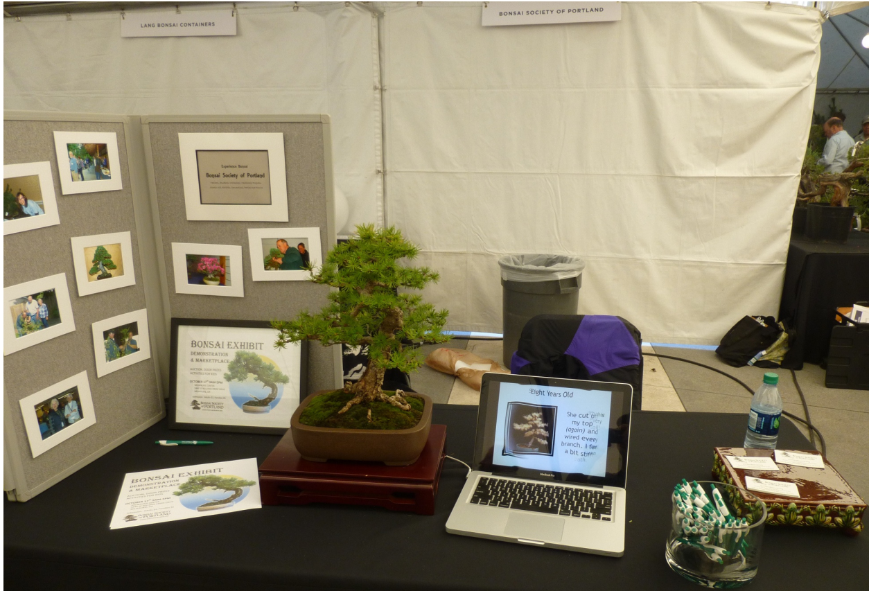
BSOP table in the Vendors tent. Eileen's Eastern Larch with accompanying video history. The video was a real attention grabber especially with children. At least two boys watched the entire presentation during the editor's shift at the table.