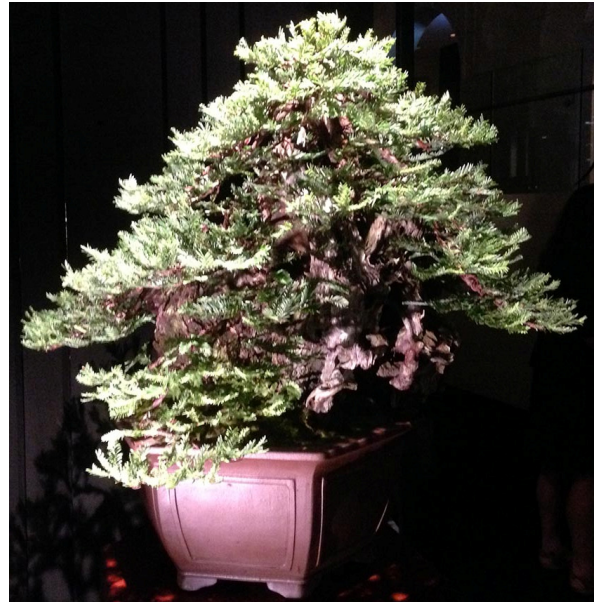
Coast Redwood – Randy Knight