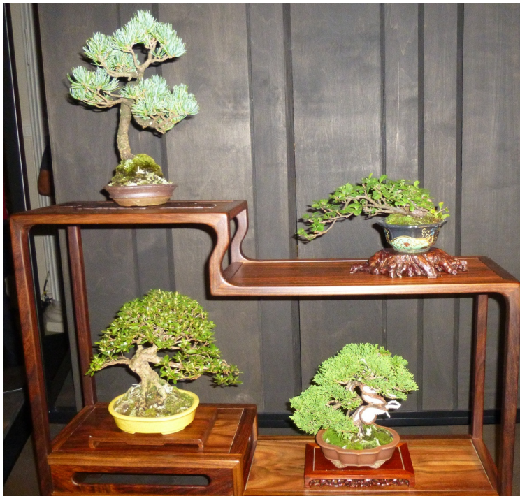
Shohin at the Artisan's Cup