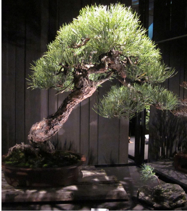
Ponderosa Pine