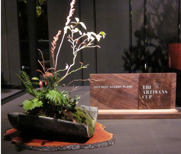
Best Accent – Randy Knight