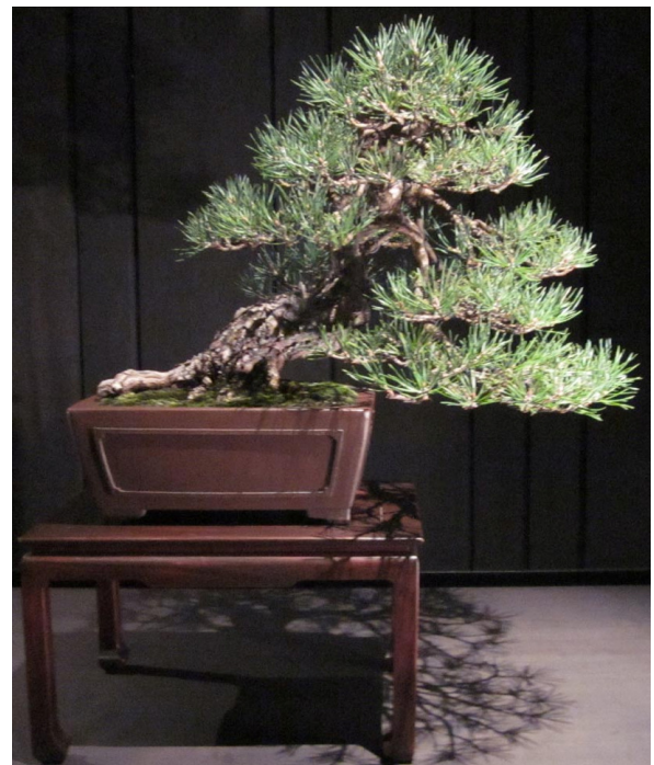
Scots Pine – Eileen Knox