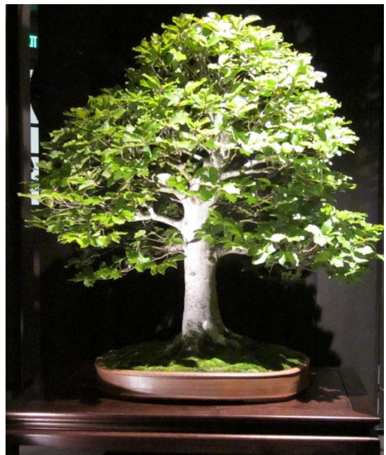
European Beech