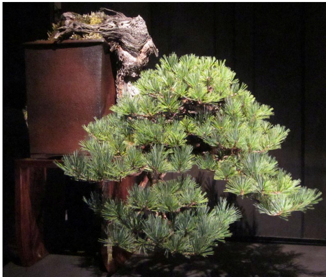
Southwestern White Pine – Greg Brenden