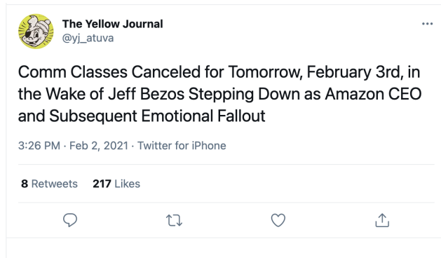
Exhibit Material #1: Tweet by The Yellow Journal

This Tweet by “The Yellow Journal” UVA Twitter page represents an informal “grab and go” type of text to gain a reader's momentary attention. Much of UVA student’s writing, as well as attention, is devoted to these forms of text which offer instantaneous fulfillment. Unfortunately, the lives of these satirical attention grabbing texts, such as this one, are brief and not as enduring as their professionally published or physical counterparts.