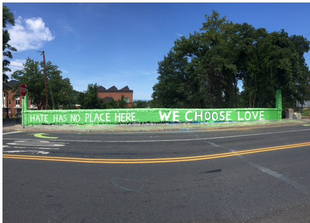
Exhibit Material #2: Beta Bridge Community Message

This exhibit piece is a photo of UVA’s Beta Bridge, a “public bulletin board” of sorts where students practice expression of ideas, current event opinions, or messages to the community by painting the bridge. This particular message was written after the 2017 race riots in Charlottesville. The bridge is repainted by anonymous students daily, so this form of text communication is short-lived; however, very meaningful and informative for our community. The bridge is a platform for more meaningful and powerful subjects than Twitter, but like Twitter these messages do not endure; perhaps a website journal documenting these daily messages could be created.