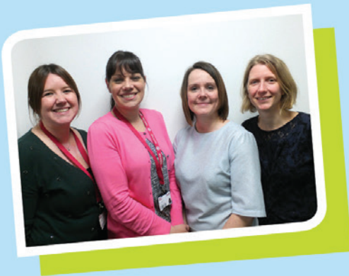
Young carer advisers at a local university

Caring is part of everyday life and it can be really rewarding. You may find you cope really well most of the time, but sometimes it's good to know where to get help if you need it. For example, if the person you care for urgently needs you while you are away from home. Wherever and whatever you study, there will be someone available to give you the time and space you need to talk things through.