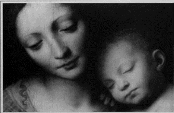
For unto us a Child is Born...

The Christmas Novena of Masses will begin on December 25, Christmas day. Cards and offering envelopes are available in the church office, if you would like to participate. Completed offering envelopes can be dropped off at the office or in the Sunday collection basket.