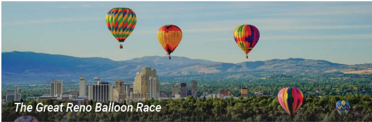
The Great Reno Balloon Race