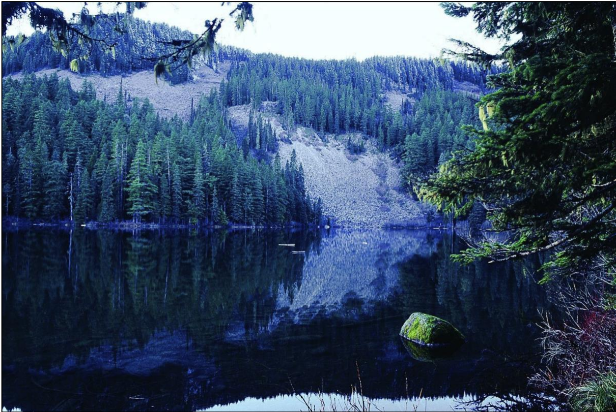
Figure 1. As of January 2009, Shellrock Lake is now safely within the Roaring River Wilderness on the Mount Hood National Forest. George Wuerthner

— Senator Clinton Anderson (D-NM) (principal sponsor of the first Wilderness Act)