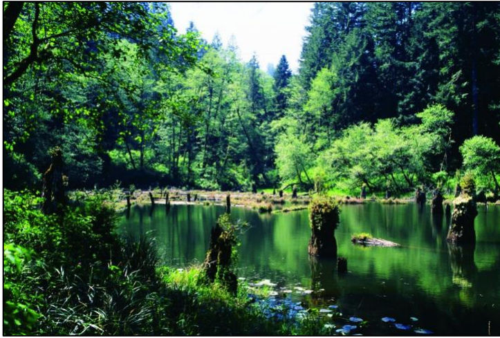
Figure 2. Wilderness designation finally occurred for Wasson Lake in the Devils Staircase Wilderness, established in 2019. George Wuerthner