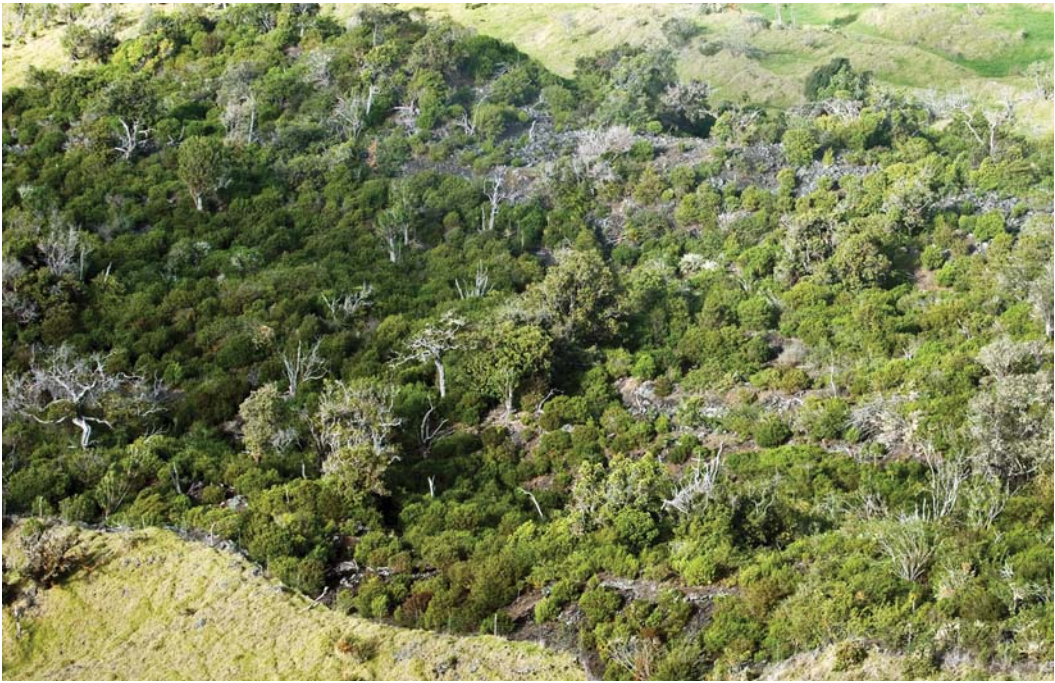
FIGURE 2. Auwahi restoration site, 2011.