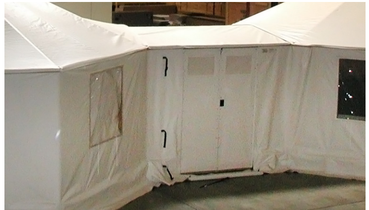
Vestibule Connector with double doors installed