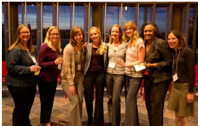
Fellows, mentors, and affiliated scholars gather for the reception at the Second Annual Doris Duke Fellowships Meeting on September 20, 2012

The November edition of the newsletter highlights the events of the Second Annual Doris Duke Fellowships Meeting that took place at Chapin Hall at the University of Chicago this past September.