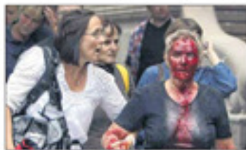
Face of horror... bloodied woman after blast yesterday

By BRIAN FLYNN and SIMON HUGHES UP to 20 people were feared dead last night after two terrorist atrocities rocked Norway. A gunman dressed as a cop massacred teens camping on an island — two hours after a huge car bomb wrecked government buildings in capital Oslo. Cops fear Islamist fanatics were out to kill Pål Isen Støffnes, who was due to visit his political party's youth camp on Utoya island — where a man was arrested. Witnesses claimed the gun maniac was blind with blue eyes and spoke Norwegian — raising fears that he was a homegrown al-Qaeda convert. Full Story — Pages 4 & 5