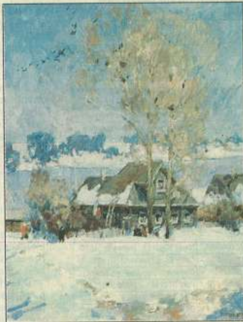
'Winter Sun' Aleksander Titovets