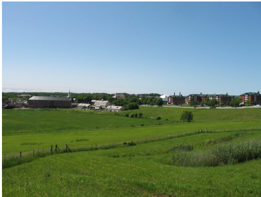
The University of Connecticut

Information on the forthcoming meeting and a call for papers