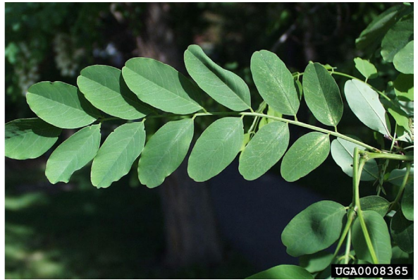
Photo caption: Foliage of black locust.