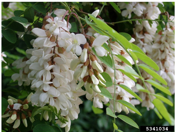
Photo caption: Flowers of black locust, Robinia pseudoacacia .