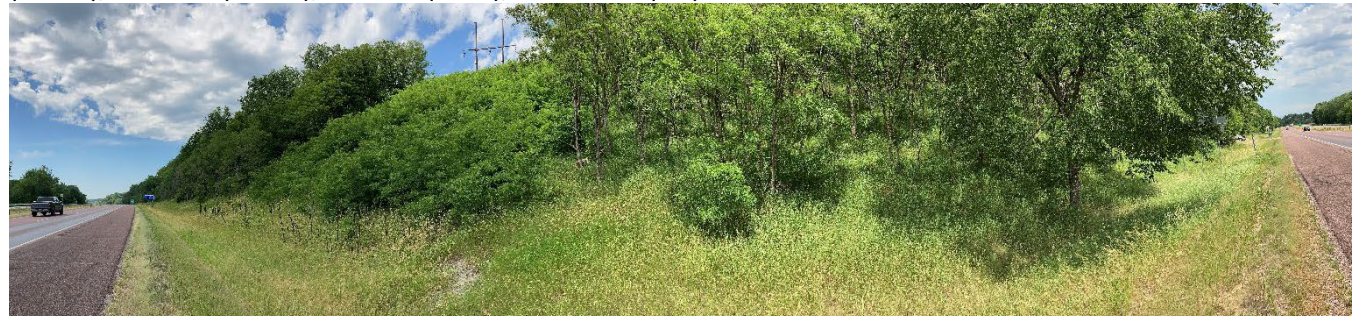
Photo caption: Vegetation along highway US-169, near Henderson, MN can consist mostly black locust. In this image, an area under a utility line had previously been cleared; black locust is growing back in a high density (photo provided by Tina Markeson, Dave Hanson, and Christina Basch Office of Environmental Stewardship, Minnesota Department of Transportation, personal communication, August 25, 2022).

Distribution: Robinia pseudoacacia has been reported from 44 counties in MN. As of 29 August 2022, EDDMaps reports that 336 acres are infested from a total of 637 sites; 3 sites in Central Park in Duluth were treated to control black locust. Current estimates of infested sites and acreage in EDDMaps are probably low given that several reports did not measure or describe the area (ha) that was infested. No recent outreach campaigns have encouraged people to map black locust in EDDMapS, though the species was highlighted during the development of the Minnesota Land Cover Classification System (MN-DNR, 2004). Dr. Laura Van Riper (Minnesota Department of Natural Resources) suggested that EDDMapS reports are probably limited to places where plants have spread on their own, as reporters have been discouraged from mapping planted specimens. Some black locust trees that were planted as ornamental specimens likely were not mapped in EDDMapS. Independent data from the USDA Forest Service Forest Inventory and Analysis indicate that as many as 1.78 million black locust trees might occur on forest land in Minnesota, primarily in McLeod (62.7%), Washington (17.8%), Houston (14.0%), Winona (4.5%), and Steele (1%) counties.