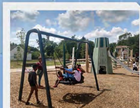
Spectacular Ella Fitzgerald Park and Fitzgerald Greenway, completed in 2018, have completely reimaged the neighborhood.

Shop local! For the 2021 Holidays, community artists, craftsmen, entrepreneurs and creatives set up inside HomeBase as Live6 debuted an exciting "pop-up" holiday shopping experience.