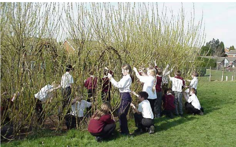
Hundreds of students at Gorsemoor County Primary School in Staffordshire, England, helped to plant a large living willow maze on school grounds.

The design for the Nature Playground at Valby Park ( Naturlegeplads i Valbyparken ) outside of Copenhagen,