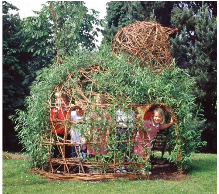
Students at Ebchester Church of England Primary School in County Durham, England, enjoy their cat-shaped playhouse.

Students and teachers at Cowick First School in Exeter, England, constructed a living willow dome on their school grounds in 1996, using Salix viminalis whips. The structure encloses a space 6 feet high and 10 feet in diameter. The dome, pictured on the first page, has matured nicely and was quite strong and leafy when observed after five years of growth. Students enjoy playing inside the dome during recess and sometimes use the space as a meeting area for outdoor lessons.