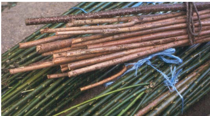
Bundles of living and dried willow whips (Salix viminalis) from a local "energy forest" await the construction process at a living willow workshop at Mårten School in Lund, Sweden.

be enhanced significantly with the assistance of design professionals and local artists. Annual maintenance on the structures, however, is generally quite straightforward and can be done by those who use them without additional professional assistance.