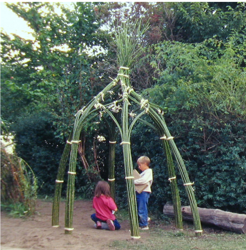
Bundles of living and dried willow whips ( Salix viminalis ) from a local “energy forest” await the construction process at a living willow workshop at Mårten School in Lund, Sweden.

Ebchester Church of England Primary School, in County Durham, England invited local artists, working