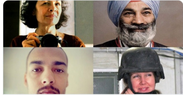
World News Day: These are the Canadian journalists who lost their lives ... Thursday marks World News Day, a day that celebrates the importance of journalism, the stories reporters tell and the sacrifices made in the purs... globalnews.ca