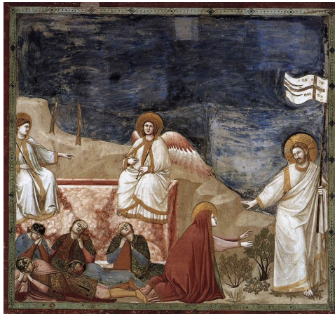
Resurrection (Noli me tangere) , Giotto Bondone. c.1304–c.1306. Scrovegni (Arena) Chapel, Padua, Italy.