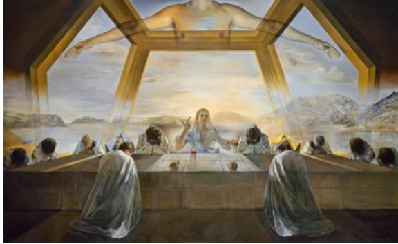
The Sacrament of the Last Supper , 1955, Salvador Dalí. National Gallery of Art, Washington D.C.

derstand what the will of the Lord is. Do not get drunk with wine, for that is debauchery; but be filled with the Spirit, as you sing psalms and hymns and spiritual songs among yourselves, sing- ing and making melody to the Lord in your hearts, giving thanks to God the Father at all times and for everything in the name of our Lord Jesus Christ.