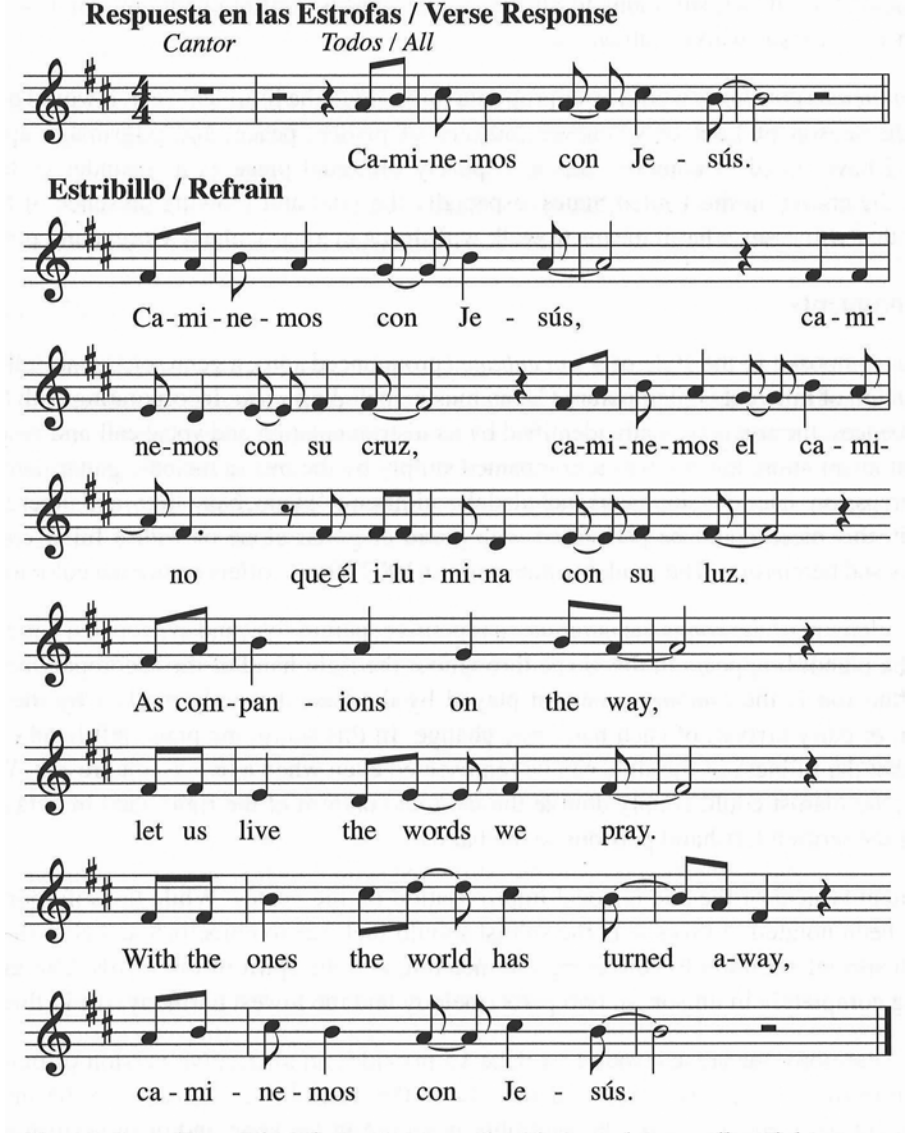
Translation of Spanish Refrain: Let us walk with Jesus, let us walk with his cross, let us walk the path illuminated by his light. Traducción del Estribillo en Inglés: Como compañeros en el camino vivamos las