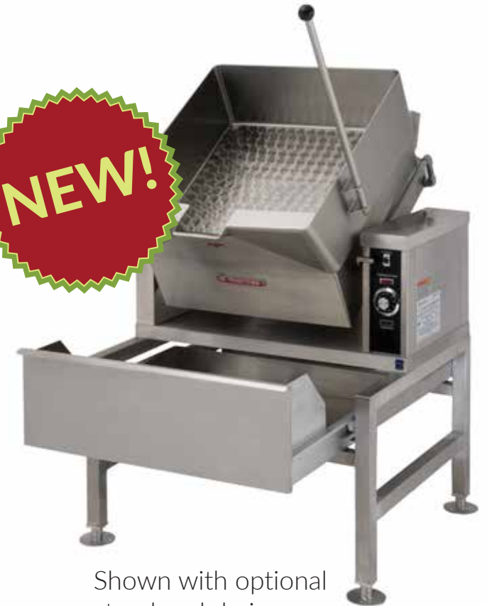
Shown with optional stand and drain