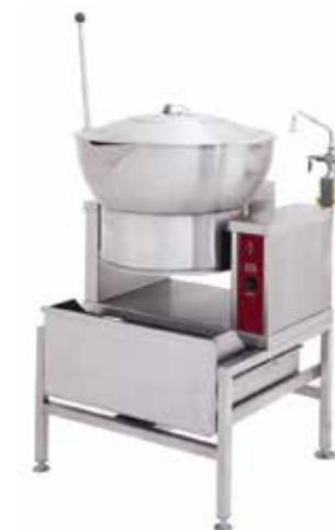
16 gallon R-1600E shown with optional stand and faucet

SafeStop™ tilting protects against accidental sloshing.