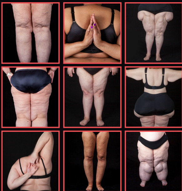
Lipedema comes in all shapes and sizes. These are photos of women with varying presentations of the condition. Texture visible in thighs; large legs with small waist; evident swelling; fat above knees and elbows.