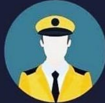
TRANSIT & TAXI DRIVERS