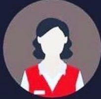
GROCERY STORE STAFF