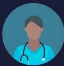
DOCTORS & NURSES