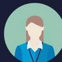
SOCIAL SUPPORT WORKERS