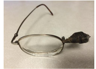
ON JESUS MISSION = Definitely time for new glasses! Jesus is giving sight to the blind!