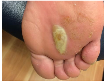
PHYSICAL CARE + Blister padded on homeless man so that he might walk to get day labor