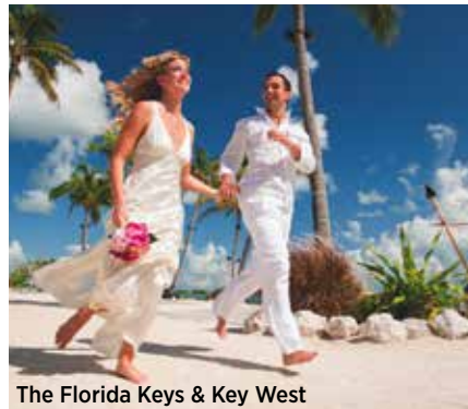
The Florida Keys & Key West

Wide soft-sand beaches, sprawling green forest and friendly small towns mix nature