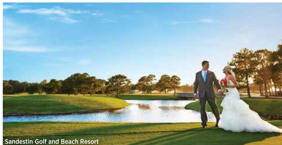
Sandestin Golf and Beach Resort