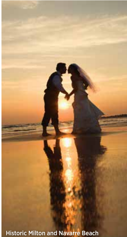
Historic Milton and Navarre Beach

assistance every step of the way. No wonder a top national wedding site names Sirata St. Pete Beach's top wedding destination year after year.