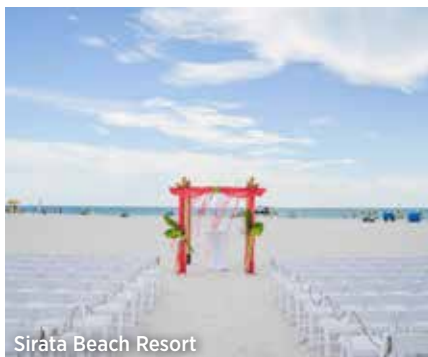
Sirata Beach Resort

Before and after the ceremonies, bond with your guests over staff-organized events from girly spa days to guys' fishing expeditions that end with a buffet of finny fare they caught themselves. Group catamaran sails are always a hit. hawkscay.com