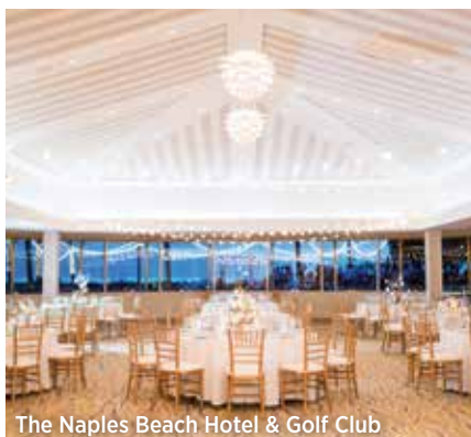
The Naples Beach Hotel & Golf Club