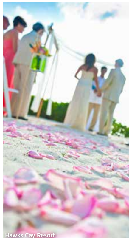
Hawks Cay Resort