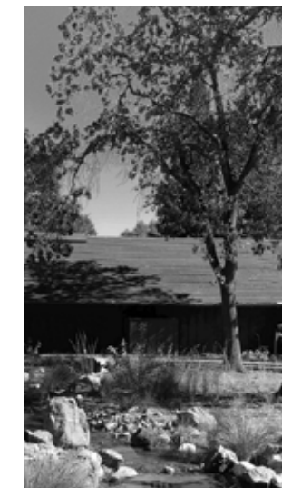
The new Salmon Stream, part of the Museum's Wild Gardens.