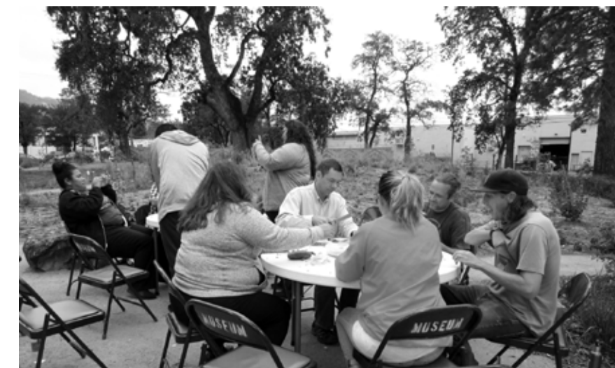
Recent visitors learning how to make traditional peppernut balls out in the Wild Gardens.