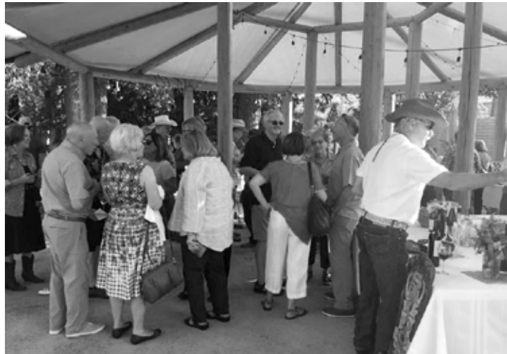
Guests mingling in the new Pomo Brush Arbor at the September Fundraiser.

It's a beautiful time of year in Mendocino County. The days are cooler, the mornings are crisp, and trees and vineyards are turning beautiful shades of gold and red. We are looking back and feeling very grateful for our members, our supporters, and our volunteers. I want to express our THANKS for all your support at the September Fundraiser. The Sun House Guild raised $28,000 that will be used to support Museum exhibits and educational programs and $21,000 for restoration work on the Sun House and its garden.