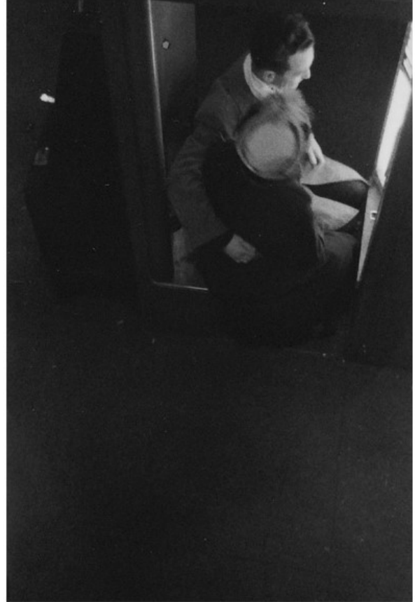
Left: F&C Walter Galerie, Herb Ritts – Headless Nude Silverlane, 1985 / Right: F&C Walter Galerie, Saul Leiter – At the Photo Booth, 1940s