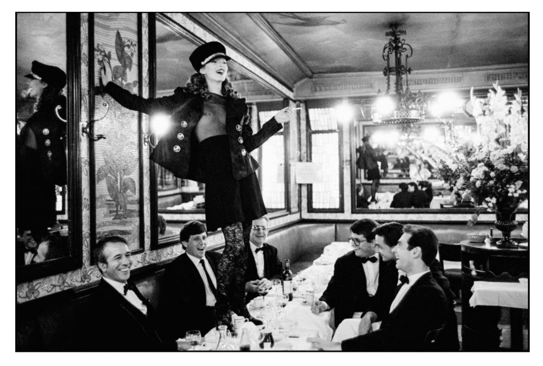
Arthur Elgort, Kate Moss at Cafe Lipp, Paris, Vogue Italia (1993).