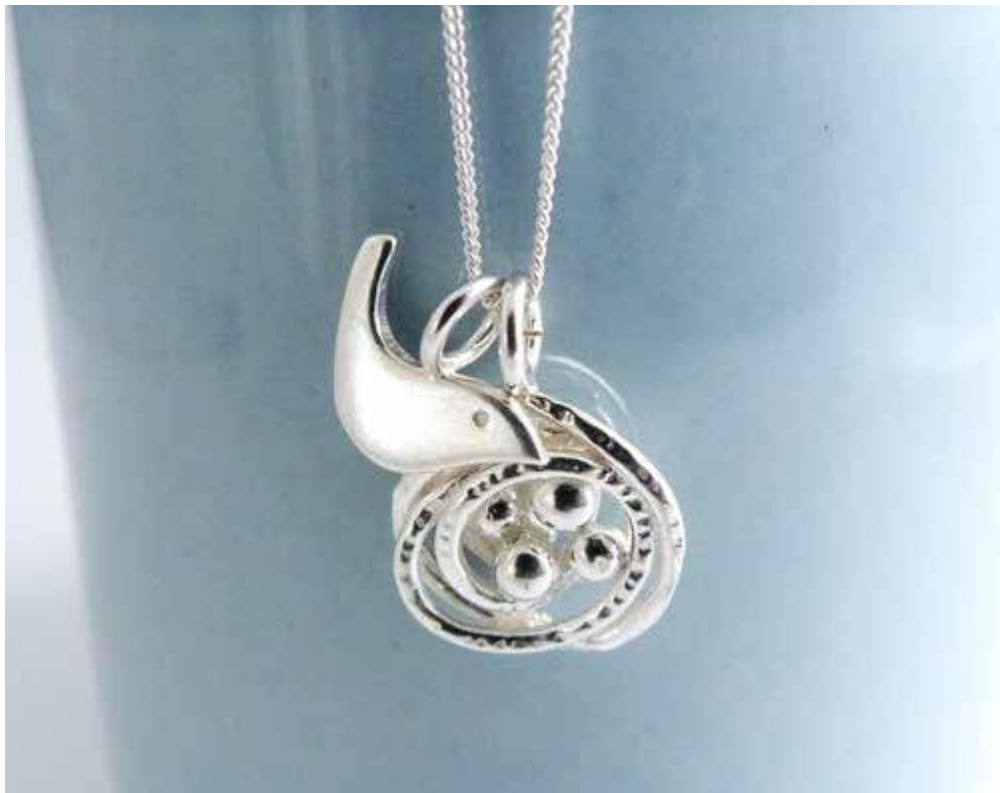
BIRD AND NEST NECKLACE