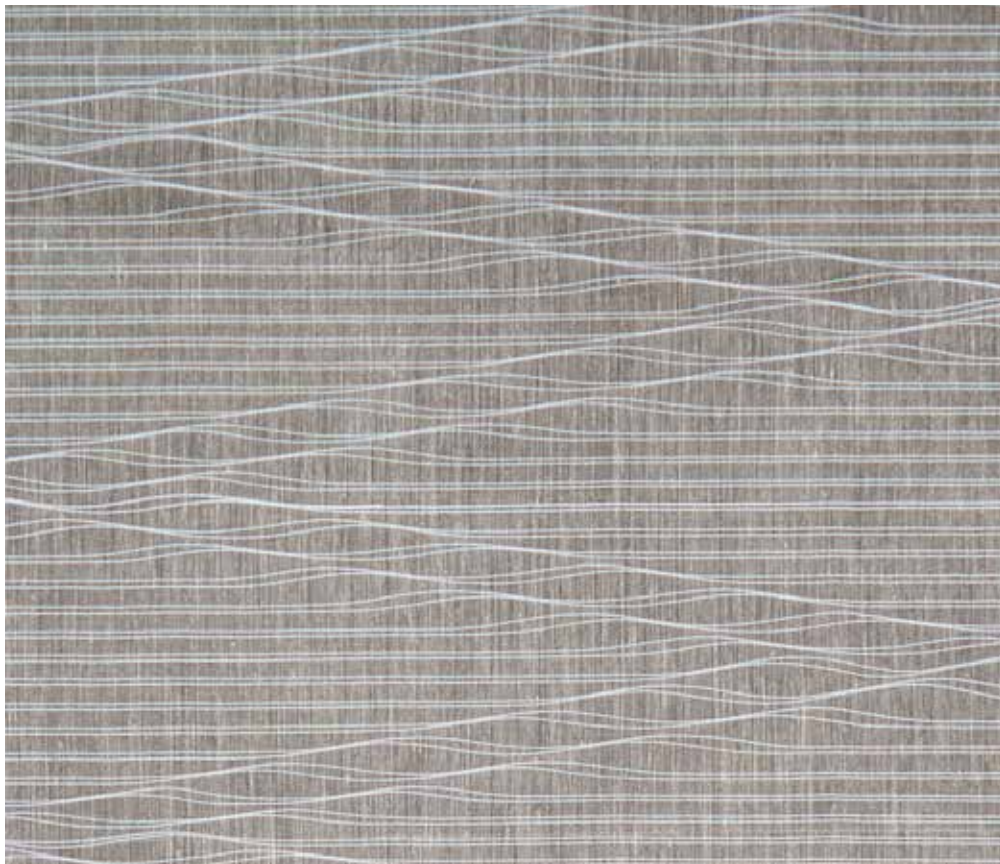
ANGLEFELL (DETAIL) C.1962