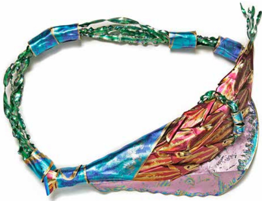
QUIVER OF FISH NECKPIECE