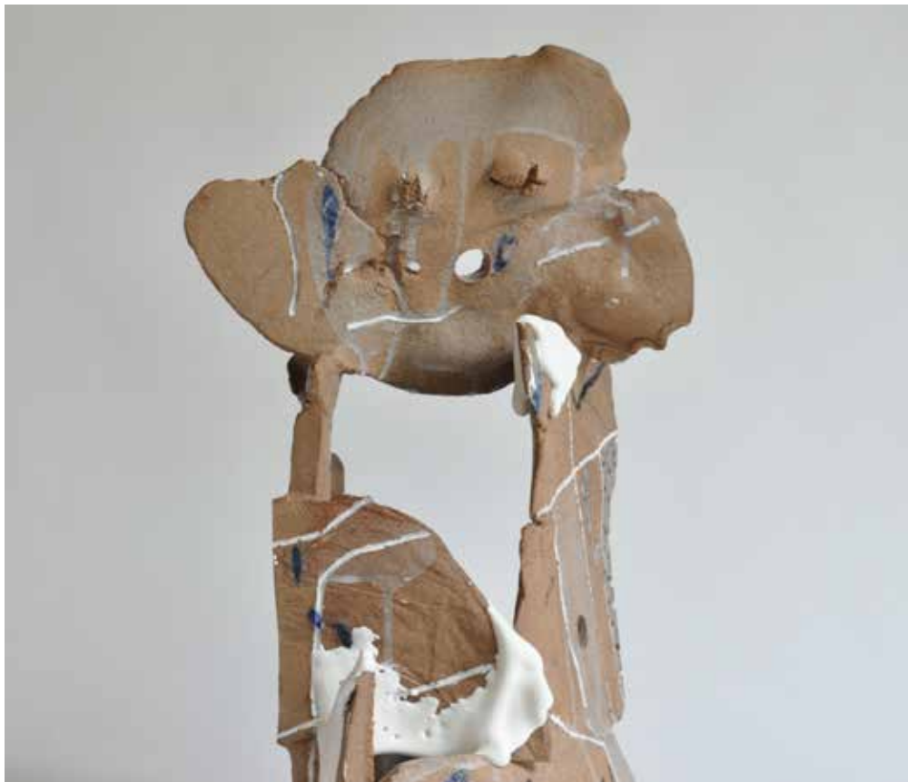
RAW FACES (DETAIL)