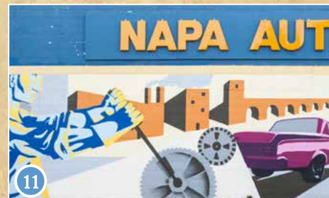
11 ARTIST: Talal Cockar TITLE: We Built the Dream, 2014 LOCATION: 606 S. 2nd St.