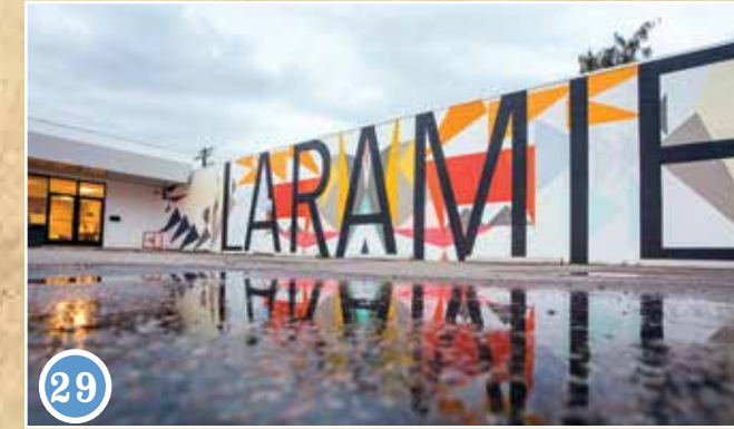
29 ARTIST: June Glasson TITLE: Laramie, 2017 LOCATION: 352 N 3rd St.