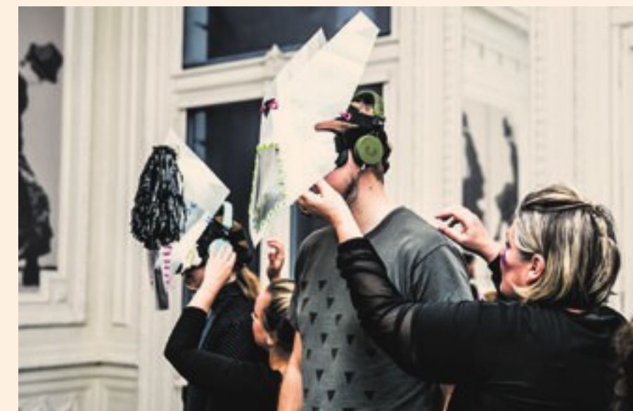
Left and above: participants in the VR-days in the Vondelpark, early November.