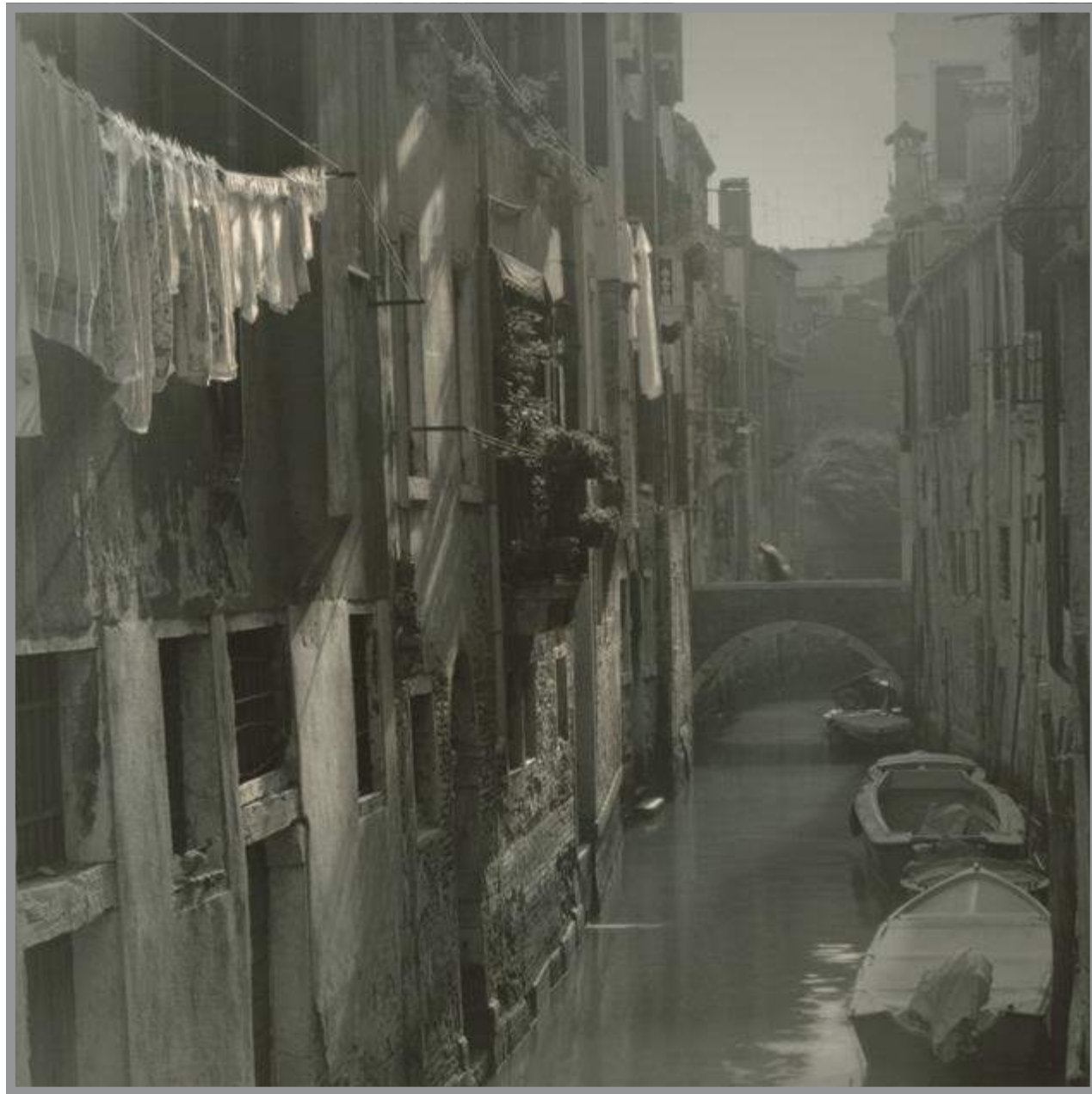
"Venice Series" – Canal/Laundry, DATE: 2006

do it – how to choose what is important, what is not important. If you choose it by wanting to choose it, you might be wrong, but when it comes unintentionally there is more... more truth to it... you have to be somehow distracted and then something strikes you at this moment, 'All right this is important. Why? I don't know.' – It doesn't matter that you don't know why this is important. If you feel it is important it's probably important. And if you decide this is important because you read the newspaper before and you later think, 'Oh yeah, this is important,' it's probably not important. It's shit. So, these involuntary decisions that make Pasternak or Dickens choose such and such situation, they have much more truth than some writers these days and certain things they think is important. Yeah, that's how I'm walking around, and sometimes I'm just looking at how the light is going down. That helps."