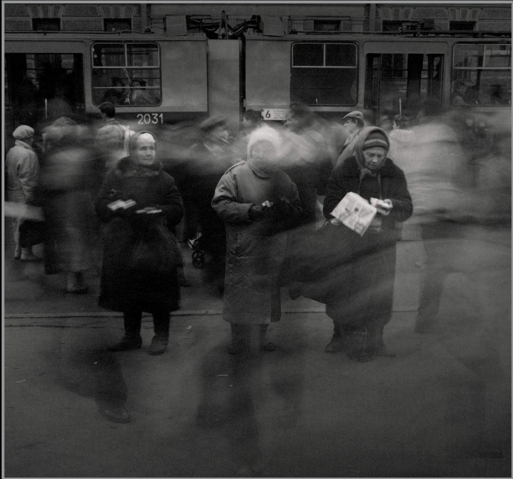
"City of Shadows" – Three Women Selling Cigarettes, DATE: 1992