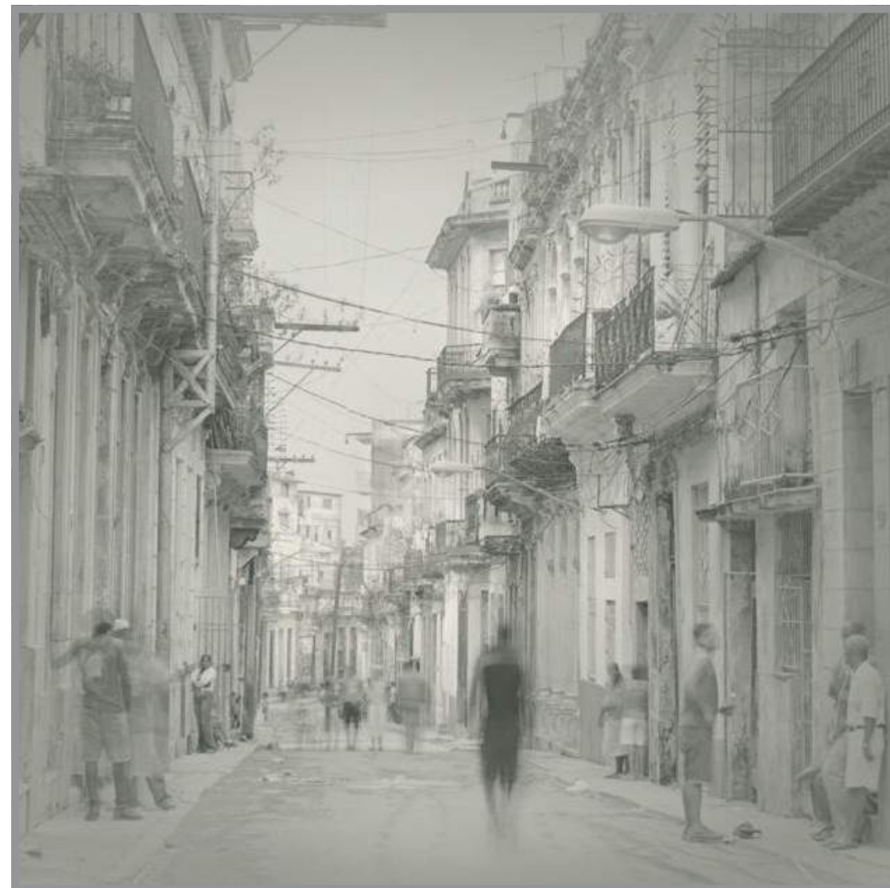
"Havana Series" – 07-06, DATE: 1996