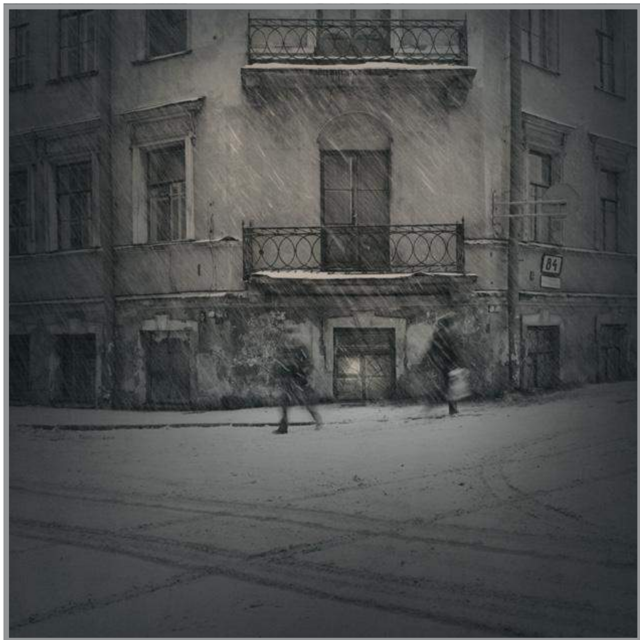
"Black & White Magic" – Window/Snow, DATE: 1996