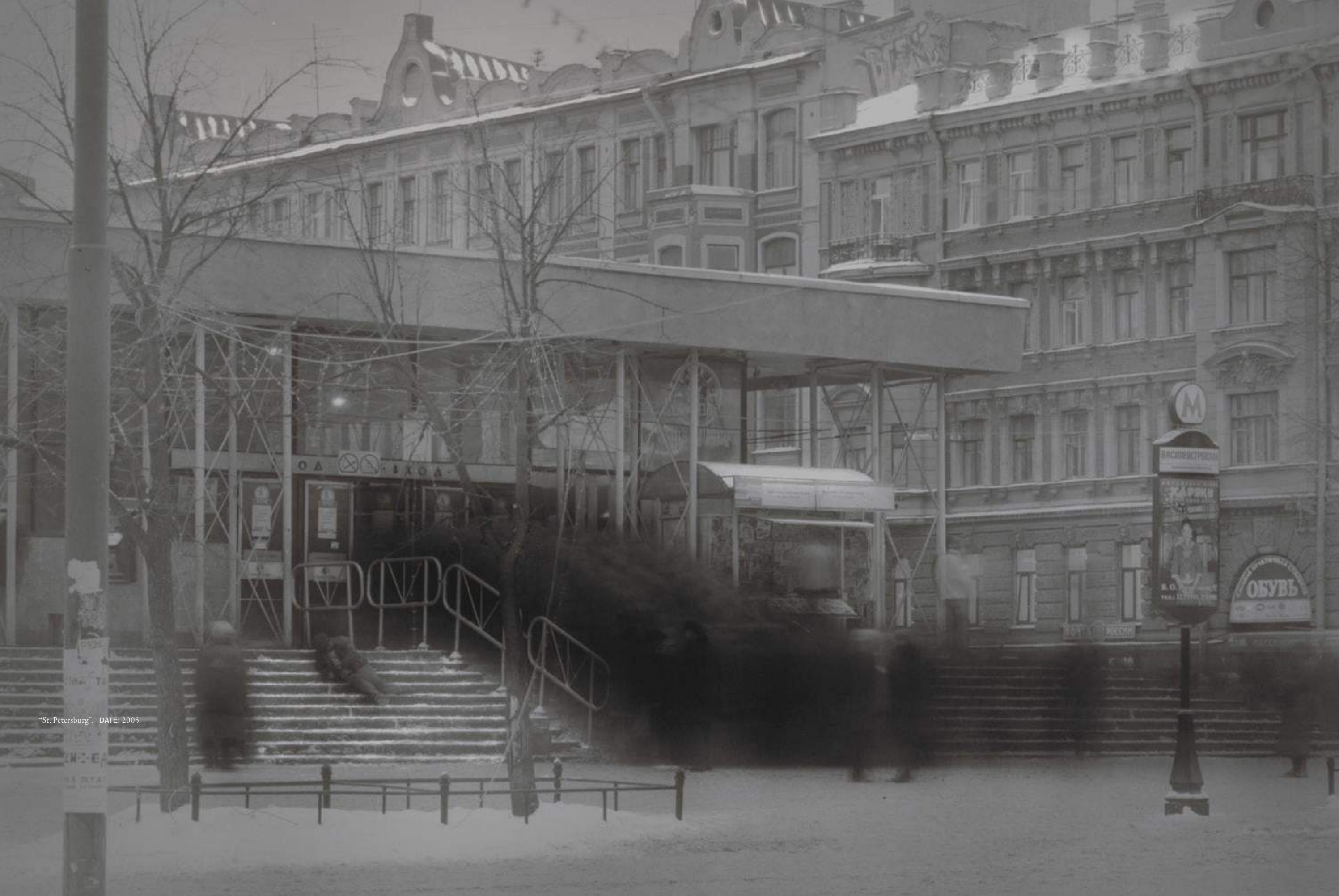
"St. Petersburg", DATE: 2005