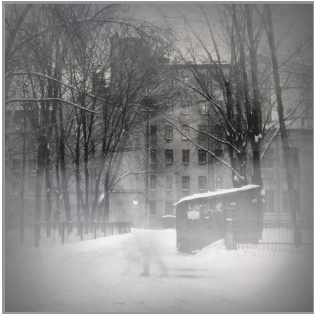
"St. Petersburg" DATE: 1996