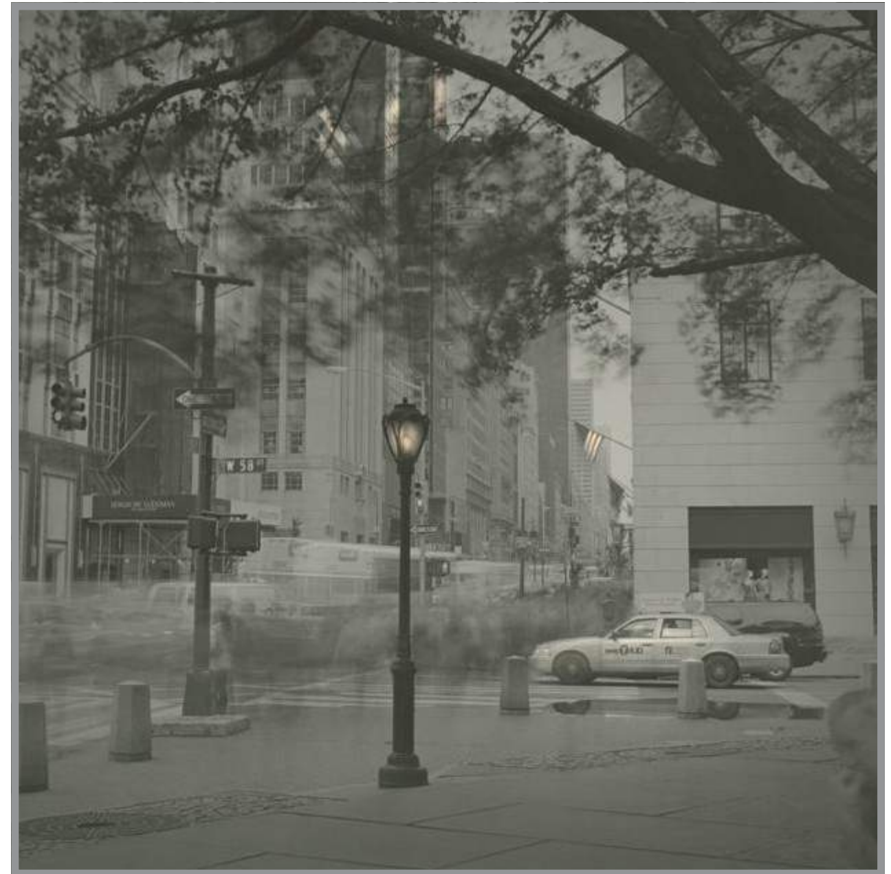
“New York Series” – 58th Street, DATE: 2012