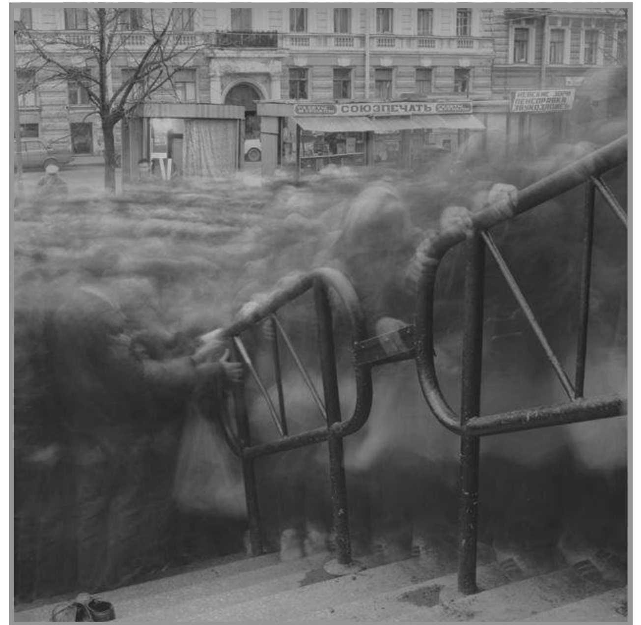
“City of Shadows” – Variant Crowd 2, DATE: 1993