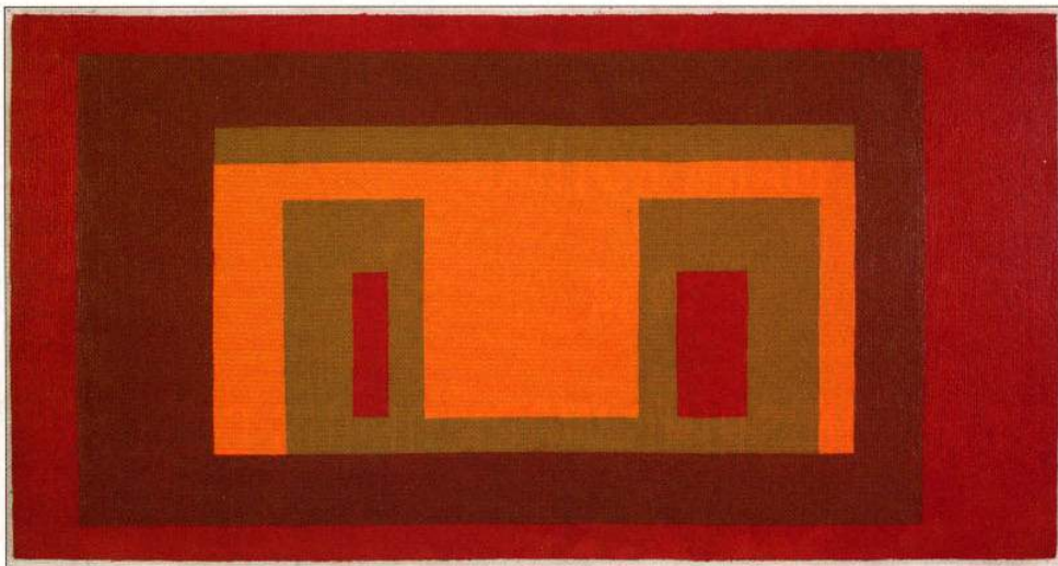
Josef Albers, Variant , 1956, oil on Masonite, 15" x 30 1/4". Brooke Alexander.