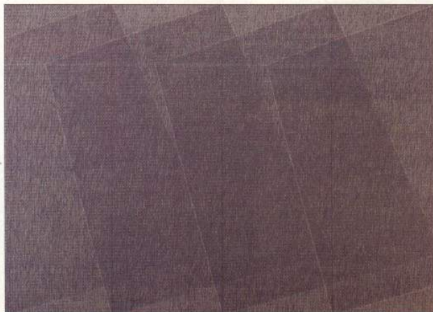
Jack Tworokov, P73 #7 , oil on canvas, 90" x 127". Mitchell-Innes & Nash.

(1973), with their finely inscribed, hide-and-seek geometric figures. Painted in what might be called gray, but actually