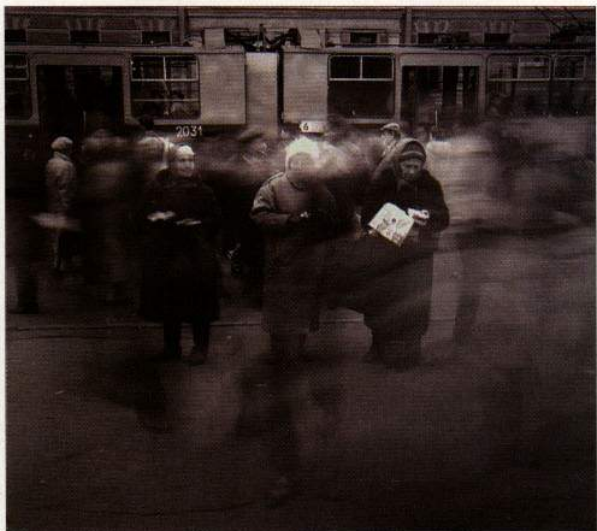
Alexey Titarenko, Untitled (Three Women Selling Cigarettes) , 1992, gelatin silver print, 16" x 16". Nailya Alexander.

The best of these black-and-white pictures allow for details that situate the scene in time and place. One of the strongest images is Untitled (Three Women Selling Cigarettes) , 1992, depicting a trio of elderly ladies, wearing scarves and shapeless coats, as they tromp onto the street to offer their wares. In Untitled (Sennaya Square) , 1998, an aerial view of an outdoor Russian market, the sellers are distinctly visible standing by their stalls, while the buyers dissolve into a river of white streaks. Many photographers in recent