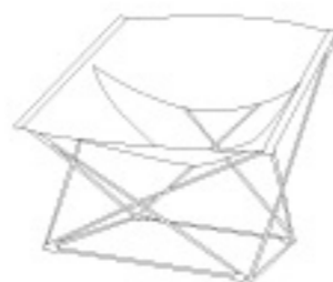
BUTTERFLY CHAIR by Pierre Paulin for Arnoform from Mulino 09 302 2284 mulino.co.nz