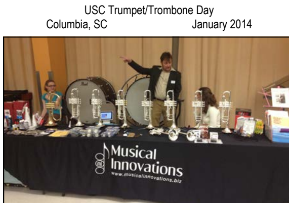
USC Trumpet/Trombone Day Columbia, SC January 2014