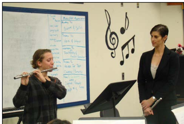
Above, master class with the West Henderson (NC) High School flutes.