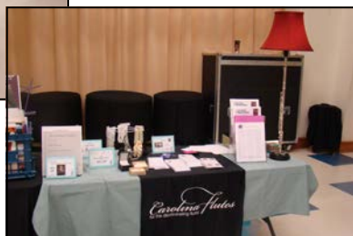
SC Flute Society Fall Festival Columbia, SC November 2014