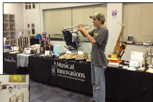
Pro Night at West Henderson High School Hendersonville, NC November 2013