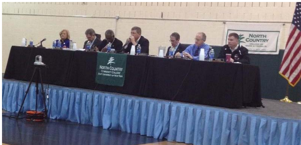
Members of the House Agriculture Committee at a regional farm bill hearing in Saranac Lake NY. L to R: Chellie Pingree (Me), Bill Owens (NY), David Scott (GA), Collin Peterson (MN), Robert Goodlatte (VA), Michael Conway (TX), Chris Gibson (NY)

The Alliance will continue to follow developments as the Farm Bill debate unfolds towards a September deadline.