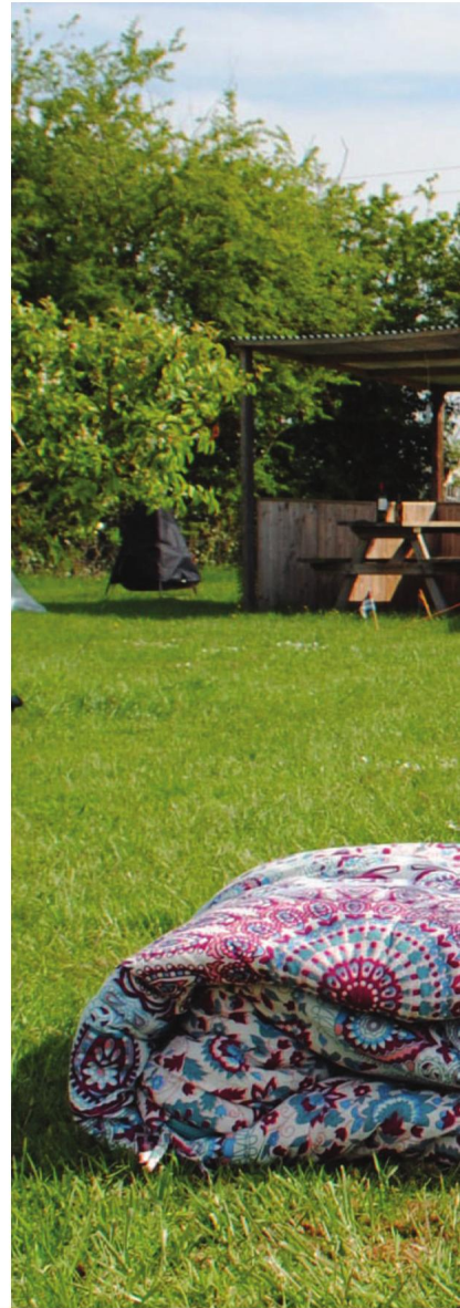
The Sleeping Beauties bags work inside or out

When styling the look of the bags, Leah opted for original boho-inspired prints. "I wanted the bags to have a sense of luxury with a nod to catwalk trends yet at the same time, to be warm and cosy.