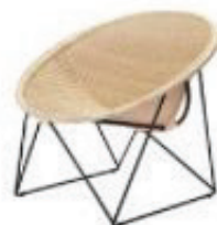
Yamakawa C317 chair £348 ( corranshop.co.uk )