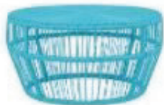
Salsa table in Ceylon £99 ( johnlewis.com )