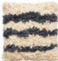
Kano cushion £98.50 ( trouvs.com )