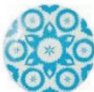
Tse & Tse Khiva presentation plate £82 ( trouvs.com )