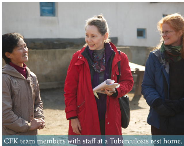
CFK team members with staff at a Tuberculosis rest home.

For those of us who travel to DPRK, it is both a burden and a blessing to work with the local people, to be present in their context, and to directly see the impact of our work. It is a burden because the suffering runs deep, and we often feel completely overwhelmed by the sheer depth and enormity of it - but it is also a blessing, because each person has been made in the image of God, and it is a privilege to care for our brothers and sisters. Meeting the North Koreans in person and seeing them face-to-face - these experiences make the long, hard days of work more meaningful and precious.