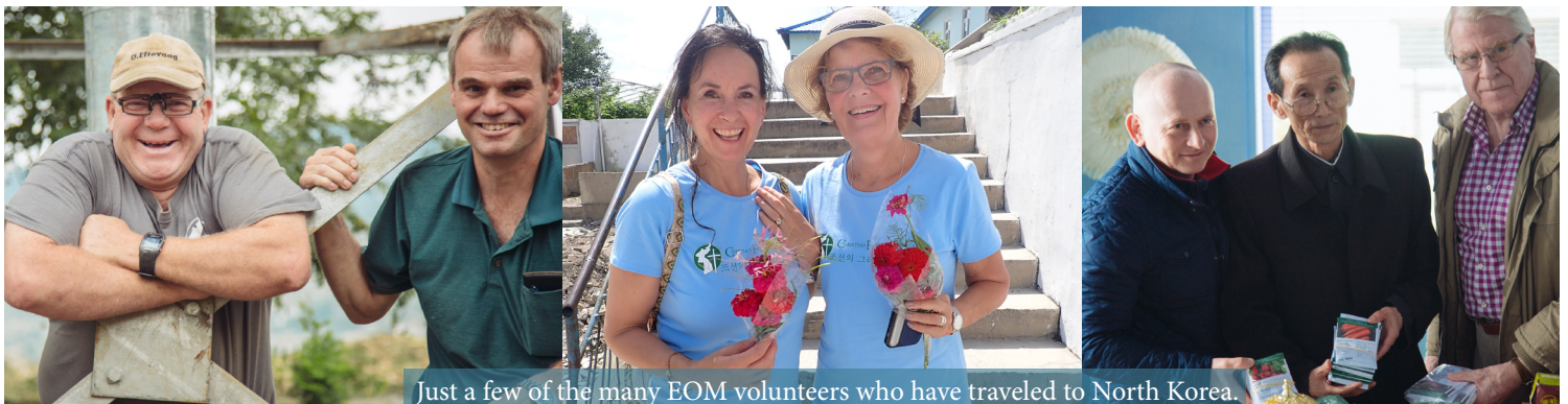
Just a few of the many EOM volunteers who have traveled to North Korea.

Through the years EOM has sent many volunteers from Norway. Some of them have participated in as many as seven work trips. They are all very motivated and blessed by this opportunity to use their skills and experience to serve.