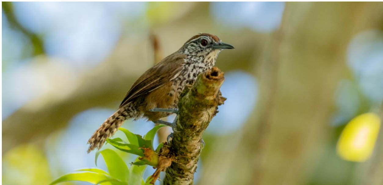
Spot-breasted Wren.

The trip was a great introduction to the wonders of Costa Rica. It was clear why it's such a popular birding destination. We only explored one small part of the country, so there's plenty of reason to return!