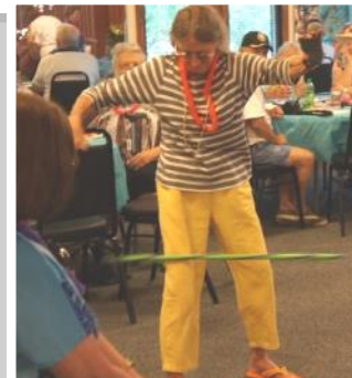
Can you hula-hoop?