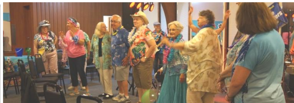
Beachy attire took the prize.

Let's rock it again with The Invaders at the Shepherd's Center Friday, August 25th 6-8 pm Tickets $10