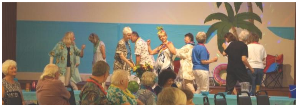
Dancing to some good ol' rock and roll. Do you recognize these teenyboppers?