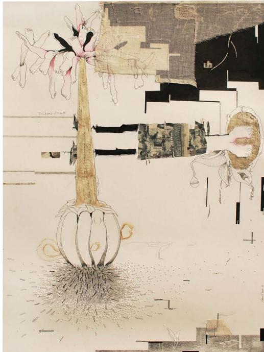
TITLE : THREE SIZE : 30" * 22" MEDIUM : MIXED MEDIA ON PAPER YEAR : 2021

Three recent graduates of a Kolkata graduate school in art share selections from their recent work. One of the works, seen above, was created by all three. ArtReach served to be a place where young artists have a chance to display art that is groundwork for what lies ahead.