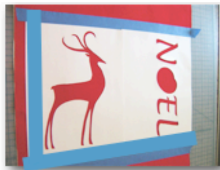
STEP # 6