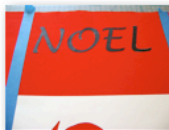
STEP # 8