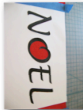
STEP # 7