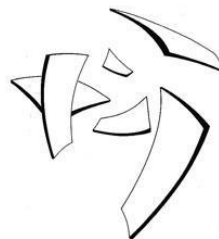
SHARDS OF THE GLOBE